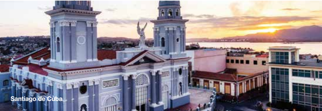
Santiago de Cuba

Oceania Cruises may modify the cruise itinerary up to and during the voyage. Air arrangements, cruise accommodations, local transportation, and optional shore excursions are arranged by Oceania Cruises, which may use other suppliers or providers to render the services.